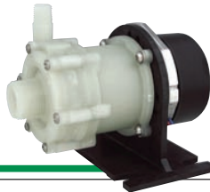
MODEL BC-2CP-MD Brushless