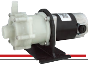
MODEL BC-2CP-MD Brush