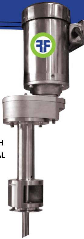
GEAR DRIVE WITH MECHANICAL SEAL