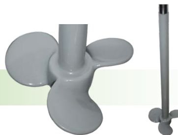
See Pg. 4 for Shaft and Impeller Coating Options.