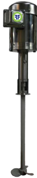
DIRECT DRIVE WITH FDA LIPSEAL